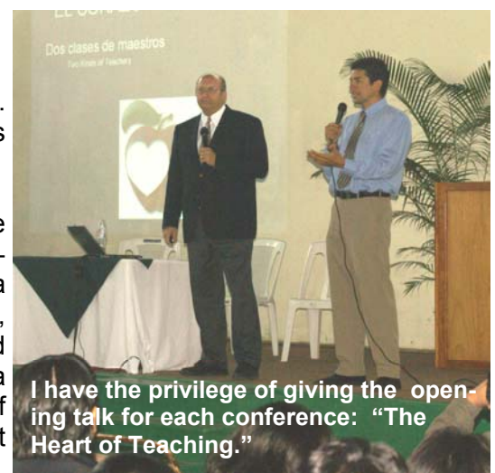
I have the privilege of giving the opening talk for each conference: "The Heart of Teaching."