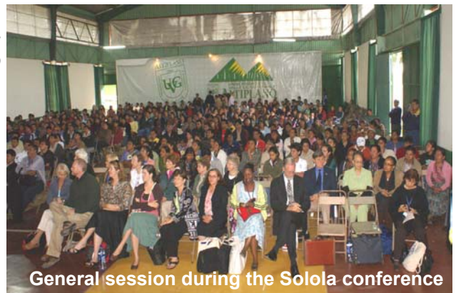
General session during the Solola conference